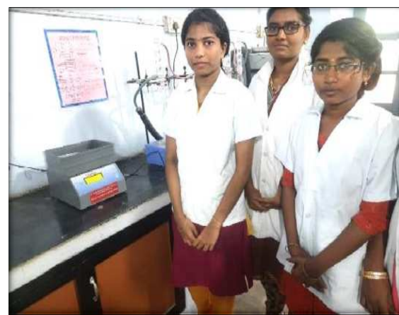
In- House Training on “Determination of BOD, COD and Soil quality Parameters” was organised by the Department of Chemistry on 19 th December 2022