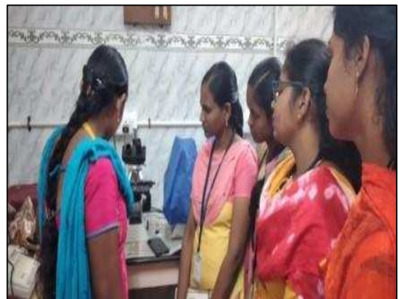
In- House Training on “Measure the Diameter of the Cell” was organised by the Department of Zoology on 21 st December 2022