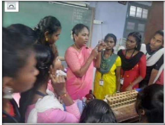
In- House Training on “Molecular Biology and Bioinformatics” was organised by the Department of Botany from 20 th to 22 nd December 2022