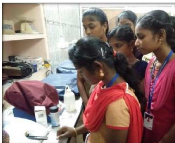
In- House Training on “Basic Skills in Biological Sciences” was organised by the Department of Botany from 19 th to 22 nd December 2022