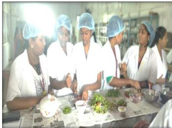
In- House Training on “Food Processing Technology” was organised by the Department of Chemistry from 21 st to 22 nd December 2022