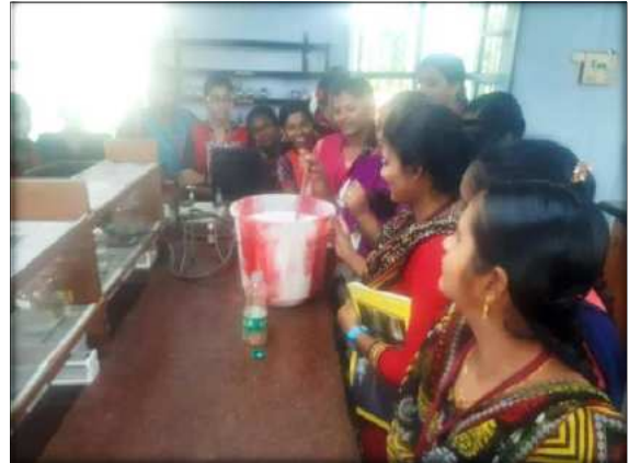
In- House Training on “Preparation of Household articles” was organised by the Department of Chemistry on 21 st December 2022