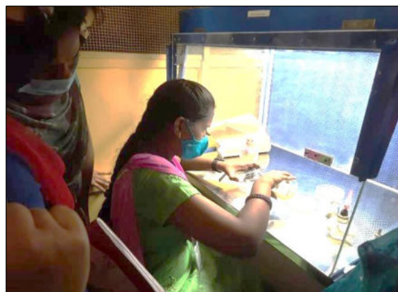
In- House Training on “Clinical Laboratory Technology” was organised by the Department of Zoology from 13 th to 17 th December 2021