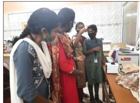
In- House Training on “Isolation and Separation of DNA” was organised by the Department of Zoology from 14 th to 18 th December 2021