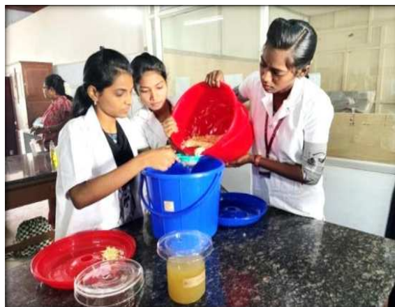
In- House Training on “Organic Farming” was organised by the Department of Botany from 19 th to 21 st December 2022