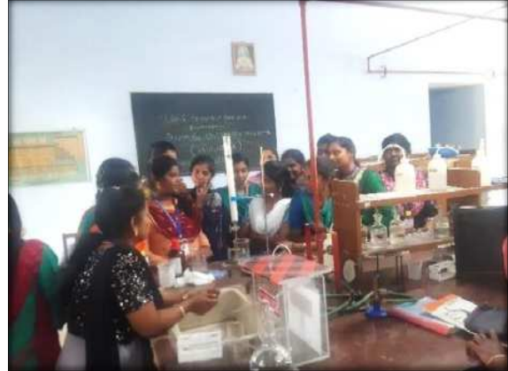
In- House Training on “Chromatographic Techniques” was organised by the Department of Chemistry on 22 nd December 2022