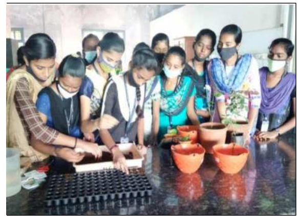
In- House Training on “Horticultural Techniques” was organised by the Department of Botany from 14 th to 18 th December 2021