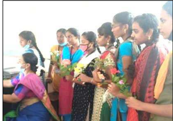
In- House Training on “Digitalization of Campus Flora” was organised by the Department of Botany from 14 th to 18 th December 2021