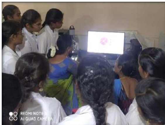
In- House Training on “Micro techniques” was organised by the Department of Botany from 19 th to 20 th December 2022