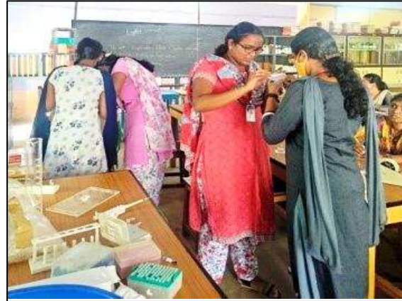
In- House Training on “Biotechnology experiments” was organised by the Department of Zoology from 19 th to 21 st December 2022