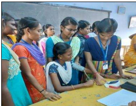
In- House Training on “Clinical Laboratory Technology” was organised by the Department of Zoology 22 nd December 2022