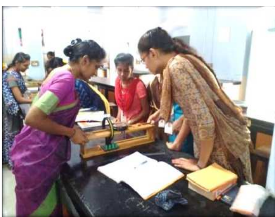
In- House Training on “Physics Practicals” was organised by the Department of Physics from 19 th to 22 nd December 2022