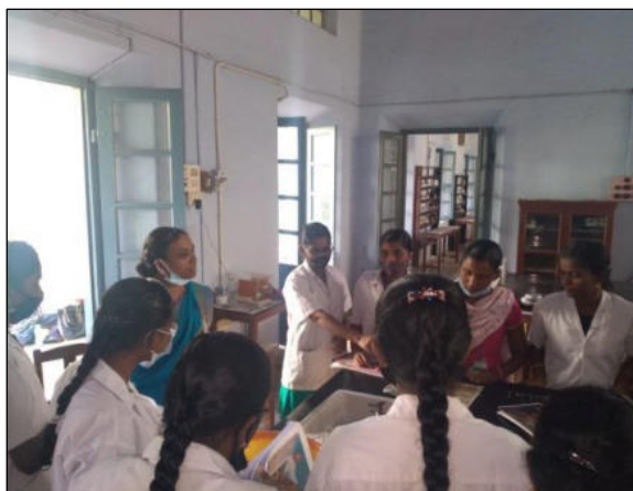
In- House Training on “Soil Analysis using Mini Soil Lab” was organised by the Department of Chemistry from 14 th to 15 th December 2021