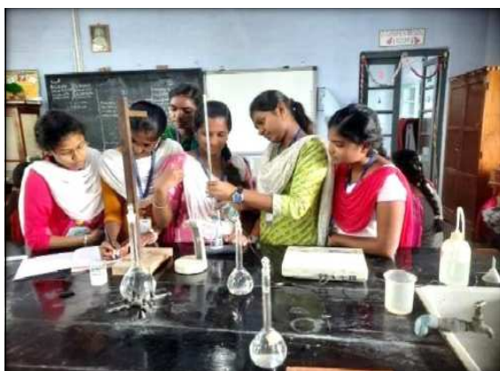
In- House Training on “Conductometric Titration” was organised by the Department of Chemistry on 22 nd December 2022