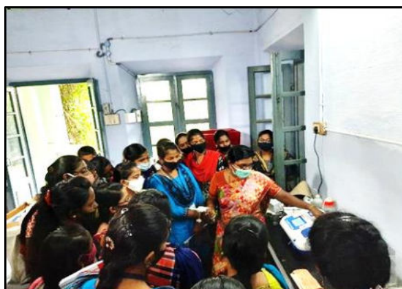
In- House Training on “Clinical analysis of blood samples using Semi Auto Analyser” was organised by the Department of Chemistry from 14 th to 17 th December 2021