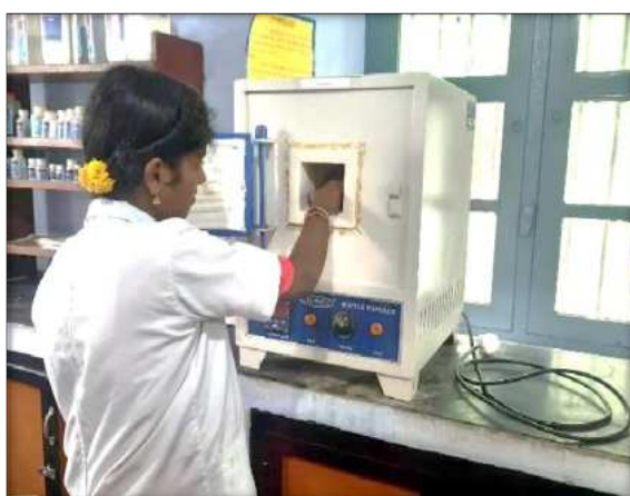
In- House Training on “Preparation of Nanoparticles” was organised by the Department of Chemistry on 20 th December 2022