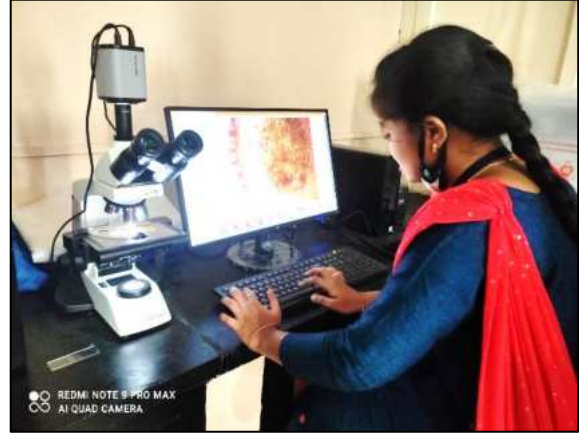
In- House Training on “Histological Techniques” was organised by the Department of Botany from 14 th to 18 th December 2021