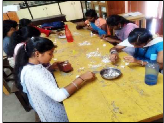
In- House Training on “Unveiling the Economic Potential of Molluscs: From Tide to Trade” was organised by the Department of Zoology on 27 th August 2024