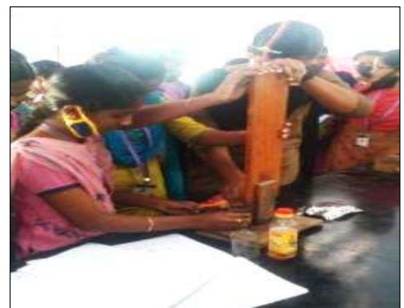
In- House Training on “Extraction and Analysis of Oil using Oil extractor and Clevenger Apparatus” was organised by the Department of Botany from 14 th to 18 th December 2021