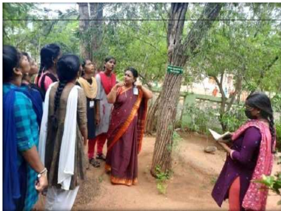
In- House Training on “Taxonomy of Angiosperms and Herbarium Techniques” was organised by the Department of Botany on 21 st December 2022