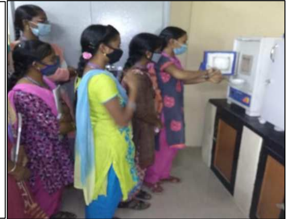
In- House Training on “Metal Analysis” was organised by the Department of Botany from 14 th to 18 th December 2021