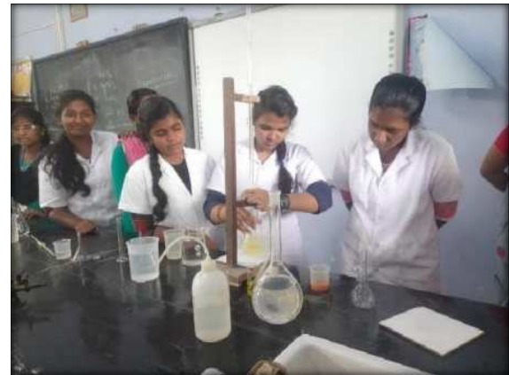
In- House Training on “Argentometric Titration” was organised by the Department of Chemistry 21 st December 2022