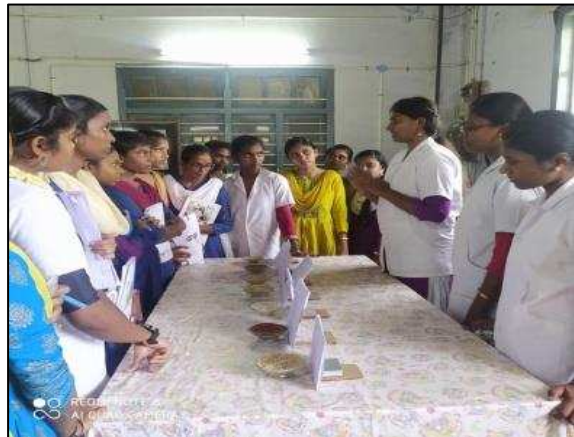
In- House Training on “Millet-based Tiffin Recipes” was organised by the Department of Botany on 28 th July 2023